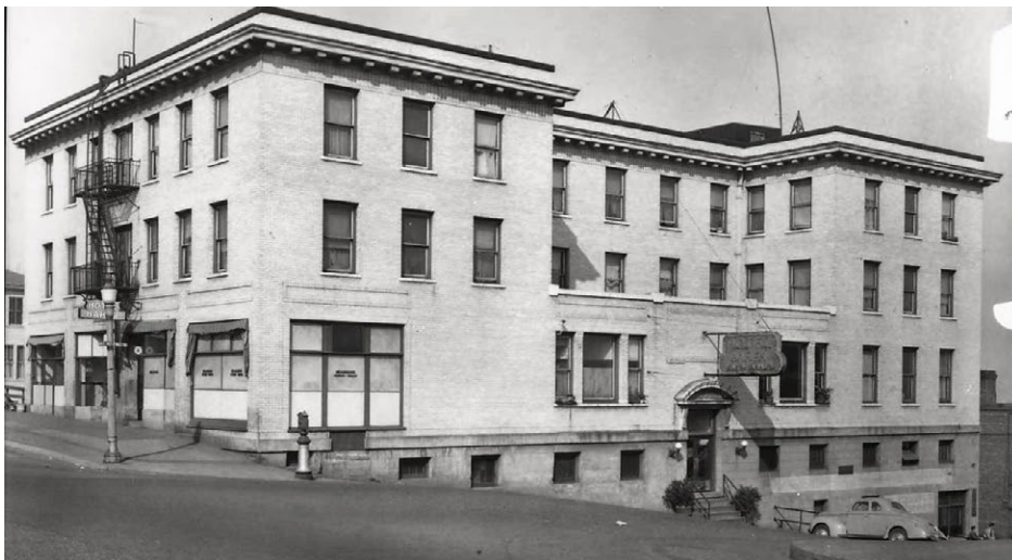
The Hiroshimaya Hotel